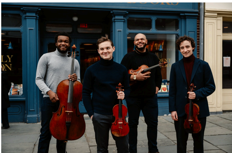
ISIDORE STRING QUARTET