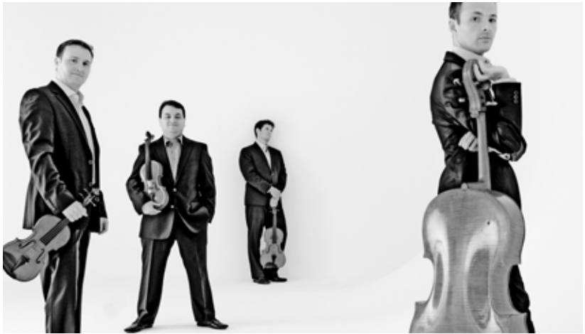
JERUSALEM STRING QUARTET

The Arizona Friends of Chamber Music (AFCM), founded more than seven decades ago, promotes classical and contemporary chamber music in Southern Arizona. AFCM's overarching goal is to help chamber music, with its special focus on delicate conversations among instruments, to thrive here. AFCM aims to develop and maintain a broad-based, sustainable audience for our concerts through creative programming, and to reach out to an ever more diverse audience through our commissioning program, our formal and informal community outreach activities, and our educational offerings.