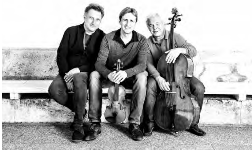
VIENNA PIANO TRIO